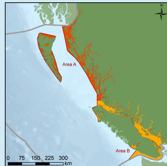
FIGURE 1: LICENCE AREAS

The salmon catch data are displayed in a geographic unit called a Salmon Catch Estimate Area (SCEA). DFO started to use SCEAs in 2001 to represent areas that can be open for commercial salmon fishing, recognizing that salmon openings are not static and can vary over time. SCEAs have been refined over time to exclude areas that are consistently not opened for any gear type (e.g., ribbon boundary around a creek mouth, protected area etc.).